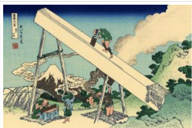
The Fuji From The Mountains Of Totomi

History (from Greek ἱστορία, historia, meaning “inquiry, knowledge acquired by investigation”) is the study of the past, particularly how it relates to humans. It is an umbrella term that relates to past events as well as the memory, discovery, collection, organization, presentation, and interpretation of information about these events. Scholars who write about history are called historians. Events occurring prior to written record are considered prehistory.